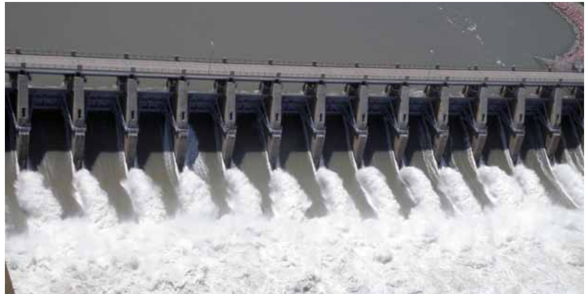
Water released from the Gavin's Point Dam on the Nebraska-South Dakota border west of Yankton, S.D, raised water levels along the Missouri River throughout the spring and summer of 2011.