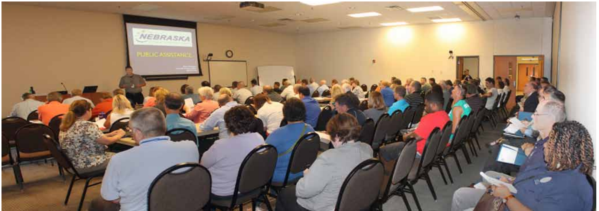
An applicant briefing in August drew a crowd at the Bellevue Fire Training Center. Public entities that sustained flooding damage learned about the process for applying for assistance from NEMA and Federal Emergency Management Agency representatives.