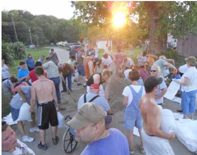
Volunteers fill sandbags to protect the water treatment facility in Peru.