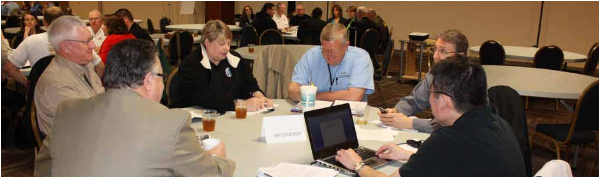
Local emergency managers work with Nebraska state agency representatives to write investment justifications for the grant application.

Another grant administered by NEMA is the Superfund Amendments and Reauthorization Act of 1986 (SARA), Title III, Hazardous Materials Emergency Planning grant from the U.S. Department of Transportation. The State Emergency Response Commission and Local Emergency Operations Plan (LEOP) revisions and updates are supported from this grant.