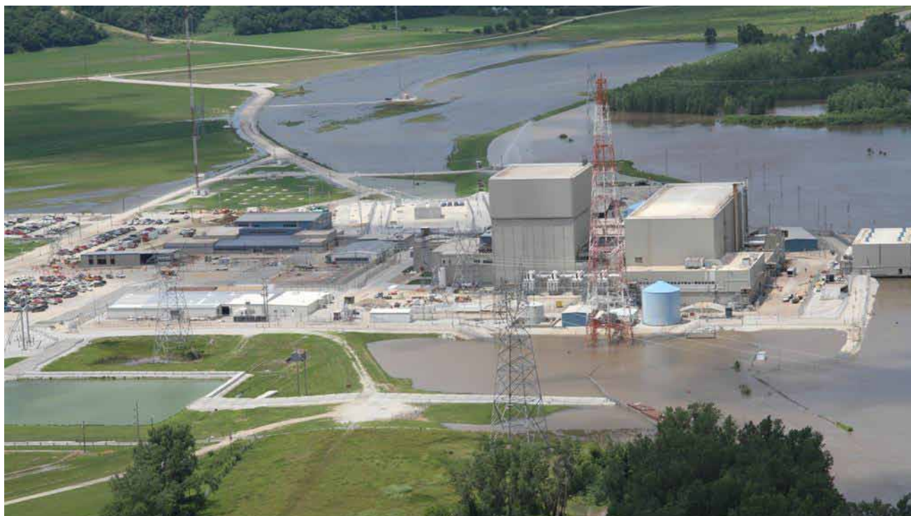
Flooding on the Missouri River affected both Cooper (pictured) and Ft. Calhoun nuclear stations. Despite record river levels, the public was never in any danger due to the hard work of Nebraska Public Power and Omaha Public Power District.

The Governor's Radioactive Materials Transportation Working Group oversees the transportation of radioactive materials and radioactive waste through the state. For incidents or accidents involving radioactive material or waste, the state maintains the Radioactive Materials Transportation Accident Plan. The plan is reviewed annually by the working group. The technical hazards section manager is NEMA's representative to the working group.